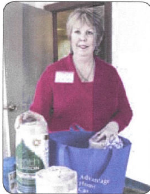
Marketing Department Maine Sunday Telegram

caregivers on staff - truly cares about the people we serve. They are why we are here. Being a Care Specialist for seniors is a job that requires dedication, loyalty, and trust.